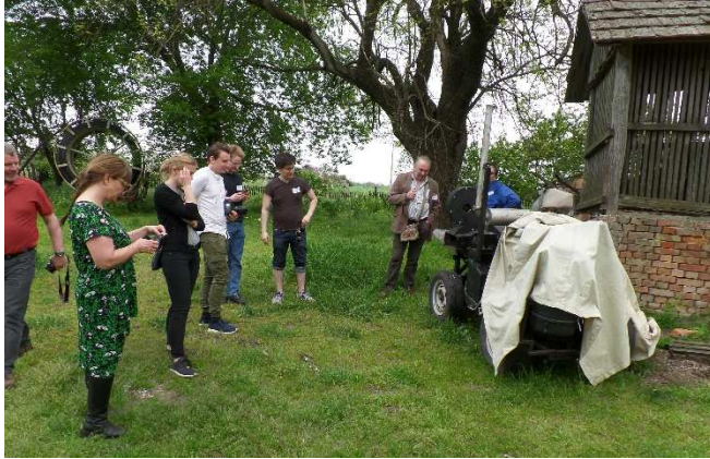
2. kép Tanyalátogatás

Shortly after the delegation arrived on April 26 th in the afternoon to Morahalom 2 brief presentations were given. The introduction slides helped them to get a better understanding about the city and the municipality itself as well as about the roles and functions of the so-called farm-caretaker service. The reason behind this service is justified by the unique structure of the municipality that is quite similar to the settlements in the micro-region, namely a compact centre surrounded by