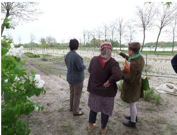
3. kép A homokos talajon nagy kihívás sikeresen termeszteni

Following the presentations, the group of 20 visited three “tanyas” that represent the local conditions the best and help demonstrating the challenges these people endure daily and how the caretakers help mitigating these challenges for those who are in need. The first location was to reinforce the notion that the fact some chooses to live at such a farm does not necessarily mean they are immediately subject to the caretaker service. These young farmers grow lettuce, turnip cabbage and celery on their 10-acre property in walk-in plastic tunnels on a predominantly sandy soil. As a result of their own well and the plenty of sunshine the region receives on an annual basis they can harvest up to 4-5 times a year, that provides the family with a solid financial background. During harvest, they use day-labourers to help them out.