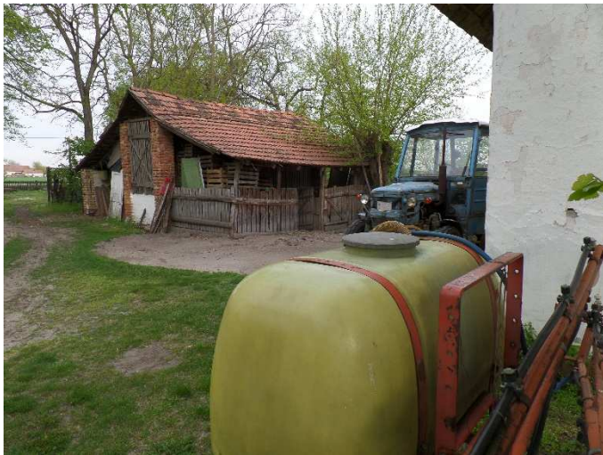
1. kép one of the local farms, called „tanya”

The project's final event had been organised at the end of April 2017 and lasted for multiple days, comprising a series of interesting occasions including a study tour, a vocational day and the final meeting itself. The total number of registered guests and audience well exceeded 100 people and the topics covered have provided not only the decision makers and the expert staff a lot to discuss about, but also involved the general public and the main target group of the local elderly whose horizons had been vastly widened about the various potentials elderly care may offer.